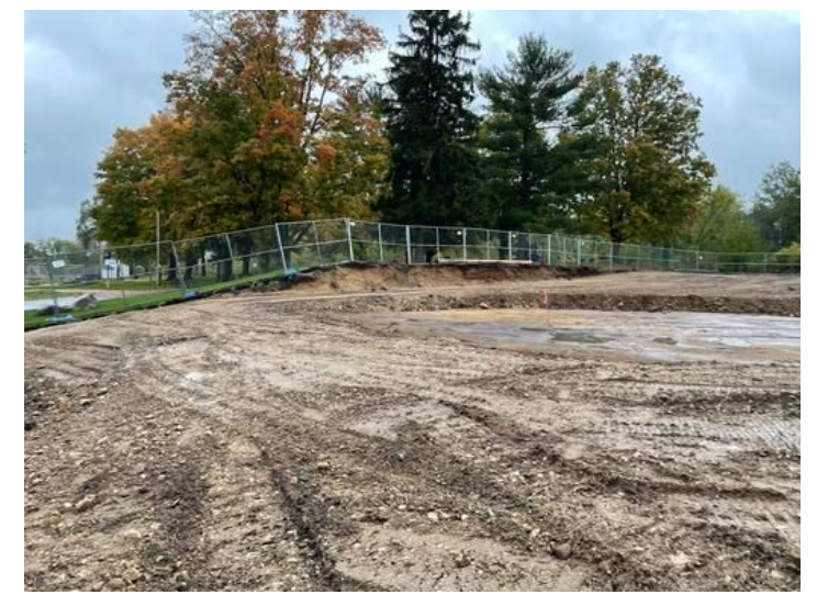
Splash Pad Taken on Oct 13, 2023, 8:52 AM CDT Added on Oct 13, 2023, 9:28 AM CDT Added by andrew gordon