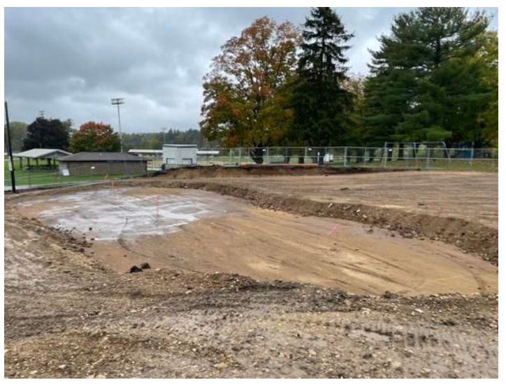
Splash Pad Taken on Oct 13, 2023, 8:53 AM CDT Added on Oct 13, 2023, 9:27 AM CDT Added by andrew gordon