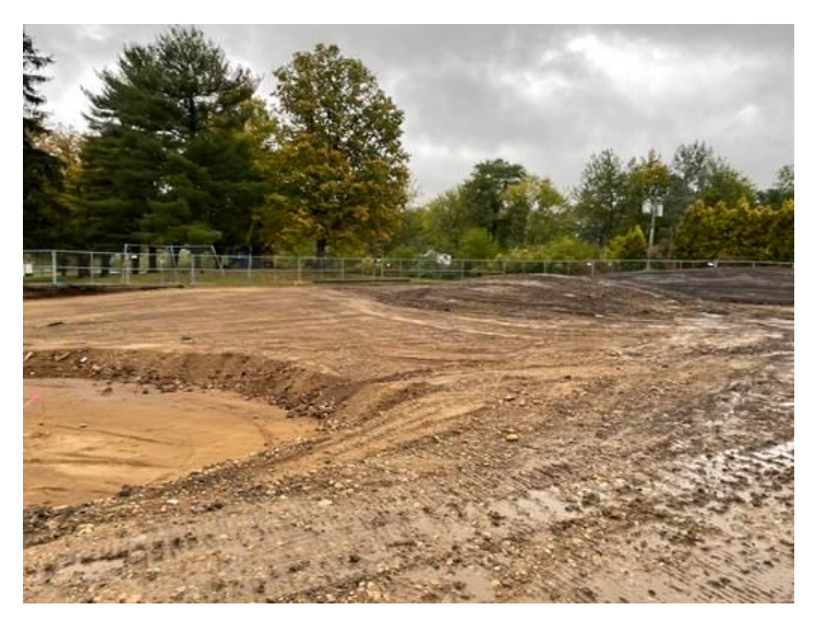
Splash Pad Taken on Oct 13, 2023, 8:53 AM CDT Added on Oct 13, 2023, 9:28 AM CDT