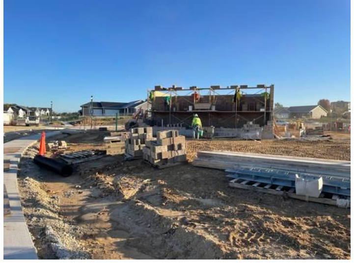
Installation of CMU on the Pump House. Taken on Oct 11, 2023, 8:21 AM CDT Added on Oct 11, 2023, 3:08 PM CDT Added by andrew gordon