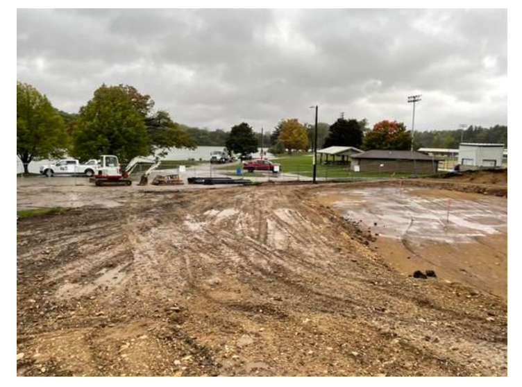
Splash Pad Taken on Oct 13, 2023, 8:53 AM CDT Added on Oct 13, 2023, 9:27 AM CDT Added by andrew gordon