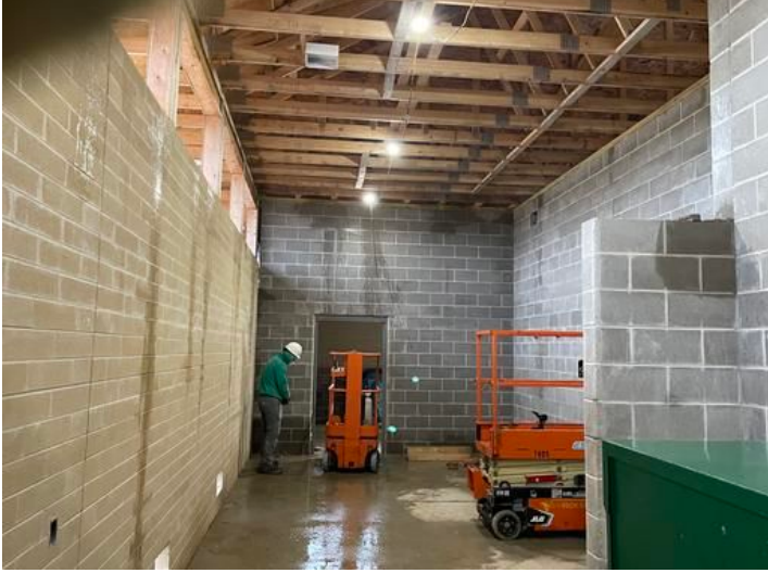
Interior Bath House clean up Taken on Oct 13, 2023, 8:10 AM CDT Added on Oct 13, 2023, 9:25 AM CDT Added by andrew gordon