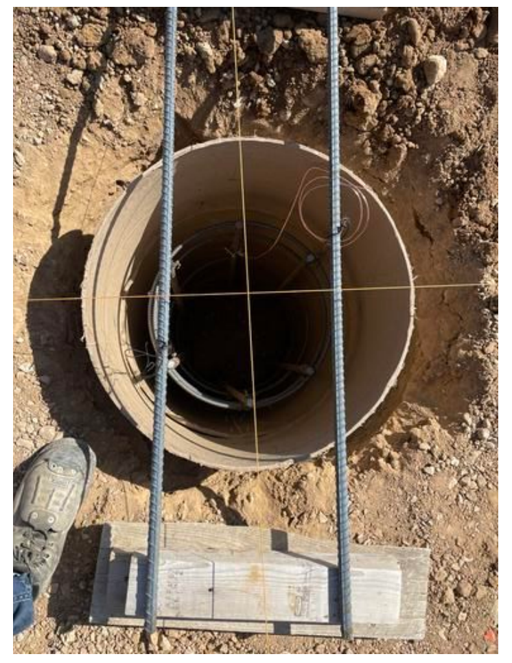
Sona tube installation for Sunshades. Taken on Oct 11, 2023, 11:44 AM CDT Added on Oct 11, 2023, 3:13 PM CDT