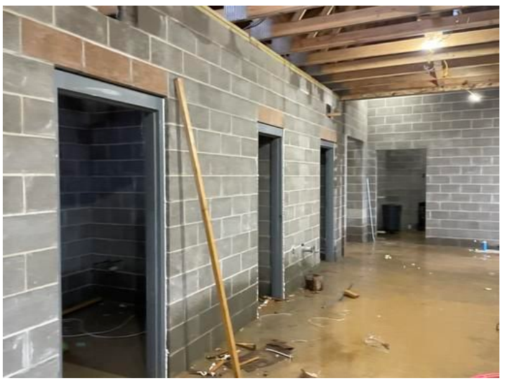
Interior Door setting Bath House. Taken on Oct 13, 2023, 8:09 AM CDT Added on Oct 13, 2023, 9:24 AM CDT Added by andrew gordon