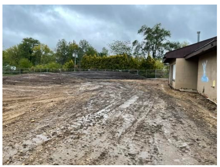
Splash Pad Taken on Oct 13, 2023, 8:53 AM CDT Added on Oct 13, 2023, 9:27 AM CDT Added by andrew gordon